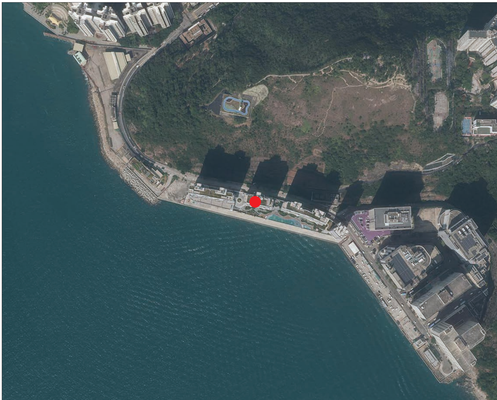
● Location of the Development 發展項目的位置